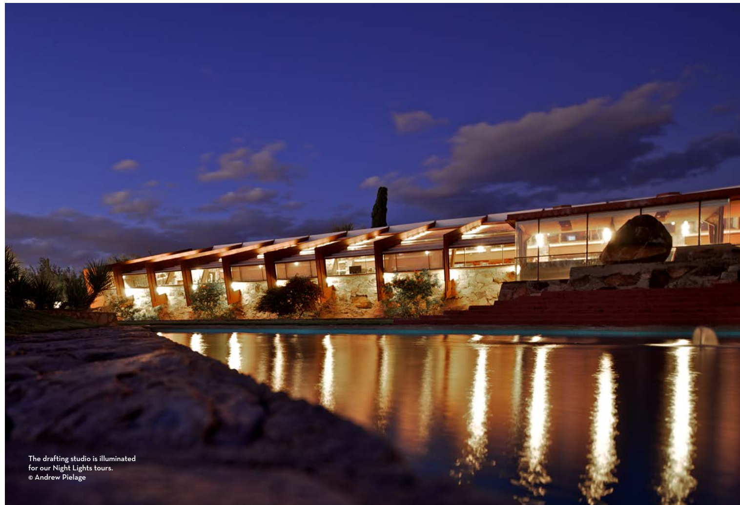
The drafting studio is illuminated for our Night Lights tours.