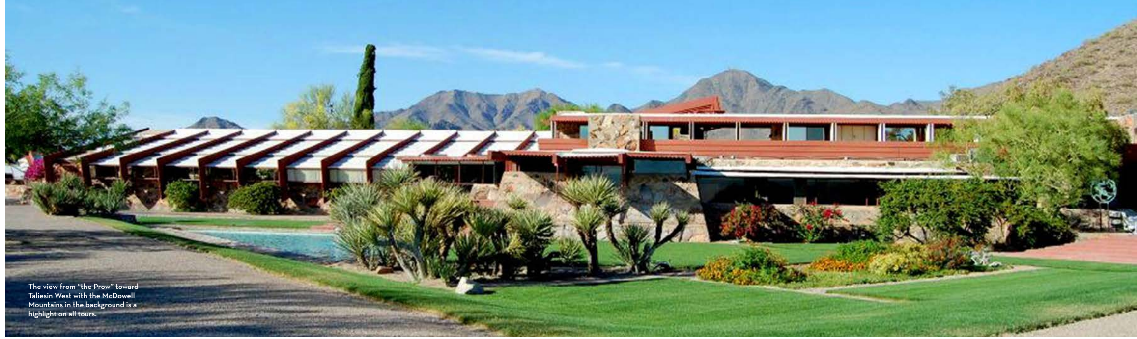
The view from “the Prow” toward Taliesin West with the McDowell Mountains in the background is a highlight on all tours.

Visit Taliesin West today and be transformed.