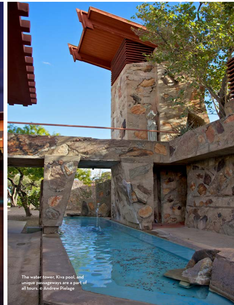
The water tower, Kiva pool, and unique passageways are a part of all tours.